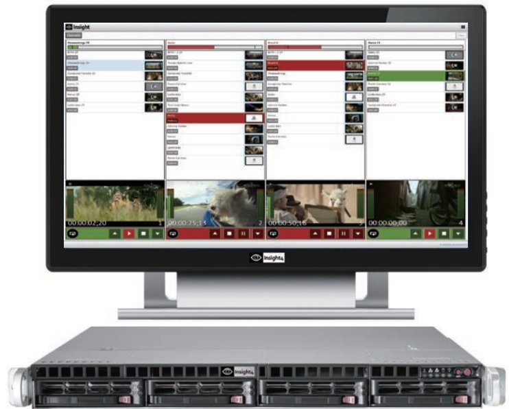
Shown with optional touch screen client computer

The Insight™ Production Server is a versatile four channel playout system designed for studio and OB Van environments.